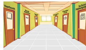
After School Clubs